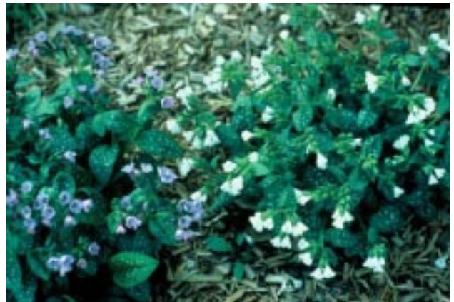
'Sissinghurst White' Pulmonaria with 'Mrs. Moon' Pulmonaria

Ohio Nursery and Landscape Association Plant Selection Committee choice in 1992.